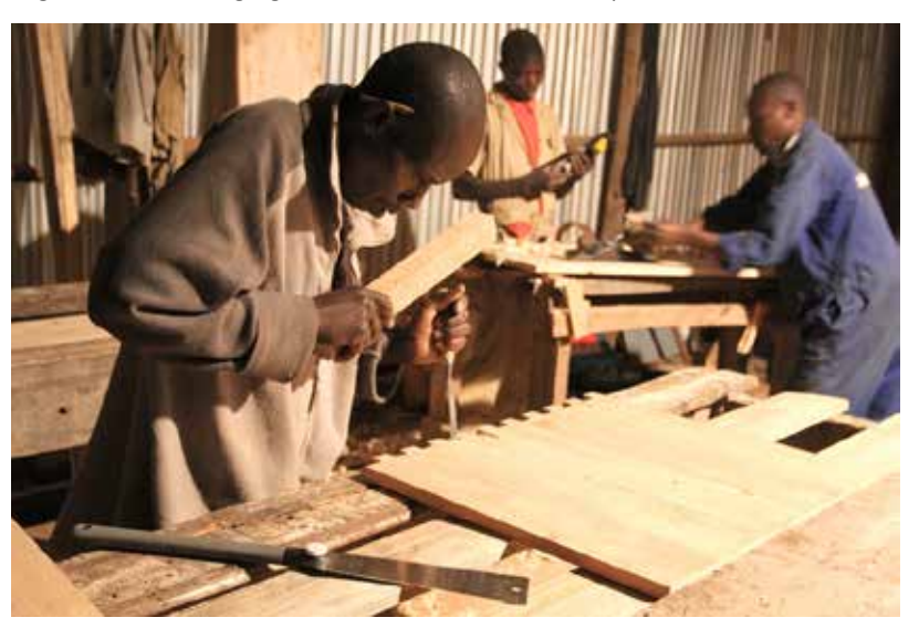
Figure 4: Locally produced carpentry.

In taking on the design of the Butaro Hospital, MASS simultaneously engaged Farmer's approach to global health, an approach that is as global in its organization as it is in its reach. At its most basic level, the Butaro Hospital is a node within a complex system of global health initiatives under the umbrella of Partners in Health, which delivers professional and community-based health care to residents in the United States, Haiti, Latin America, and Africa, building hospitals and clinics, training medical professionals, and creating public health systems. Partners in Health works in partnership with local governments and health organizations, bringing modern medical care to impoverished communities